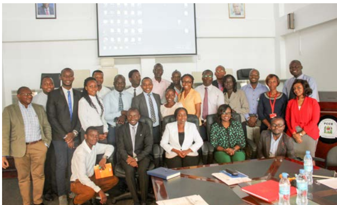
The TGCL student group at the Prevention and Combating of Corruption Bureau (PCCB).