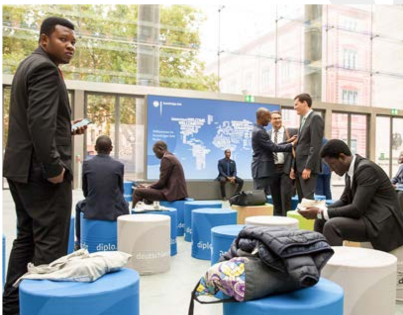
A short break after a successful visit to the German Federal Foreign Office in Berlin.