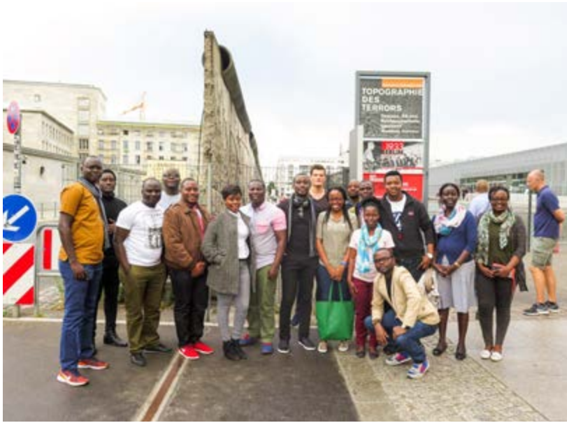
In Berlin, the students visited the historical site of the Berlin Wall, with a remnant of it (in the centre, left).

neighbouring countries, culminating in the Second World War (WW II). The museum also depicts the aftermath of WW II in Germany, by itself (the unfinished Nazi Party Conference Hall), and by the facts contained in it; one of these facts is the occupation of Germany by the victorious allied powers (the United States, Great Britain, France and the Soviet Union). The tour was extended to the Nuremberg Trials Court, where trial of the former Nazi party leaders who committed crimes against humanity, crimes against peace and war crimes was conducted by the allied powers in the famous "room 600". The students were able to compare their visit to the historic Nuremberg Nazi Party Documentation Centre and Rally Grounds with their visit to the Campaign against Genocide Museum and the Kigali Genocide Memorial Centre in Kigali, Rwanda. Both museums and documentation centres show the historical facts (in visual and audio media) concerning the most notorious crimes against humanity committed in Europe and Africa in the 20th century. Also, the Nuremberg Trials Court matches the International Criminal Tribunal for Rwanda established by the United Nations in Arusha, Tanzania to prosecute the perpetrators of the genocide against the Tutsi in Rwanda in 1994.