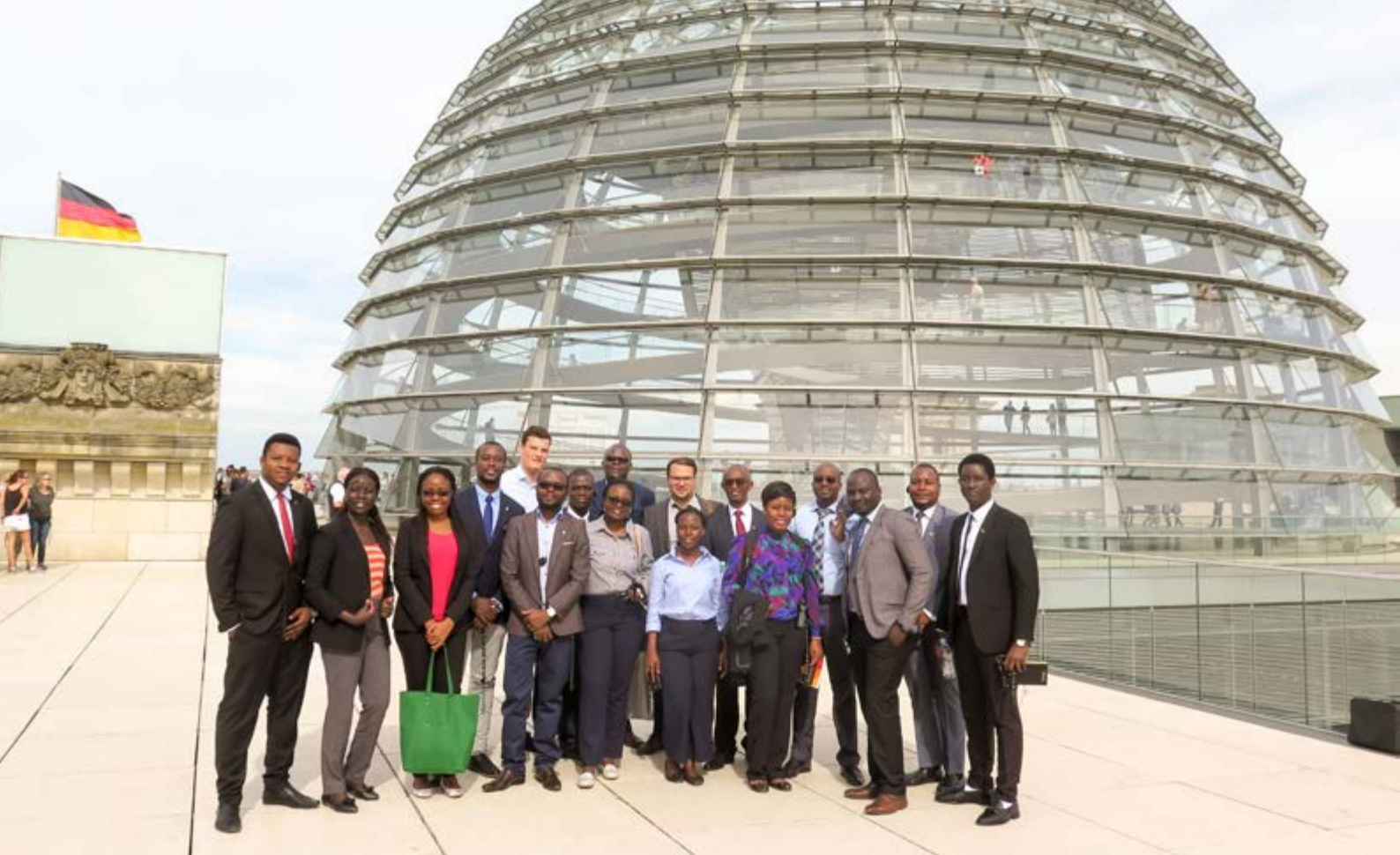
The TGCL Autumn University participants in Berlin, in front of the dome of the Reichstag building.