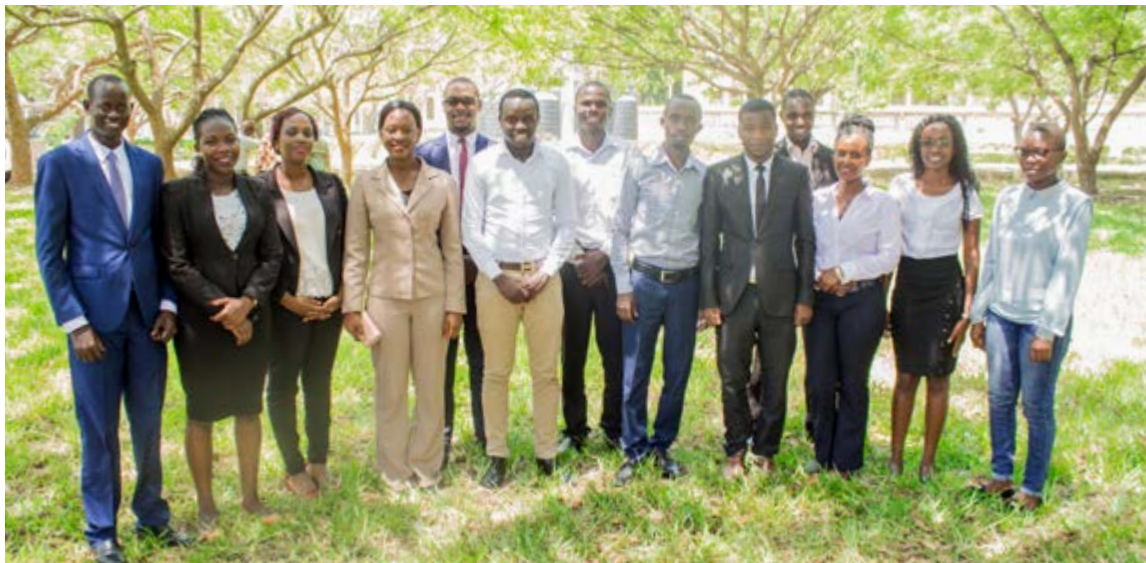
The 2018/2019 LLM students at the Mikocheni Campus.